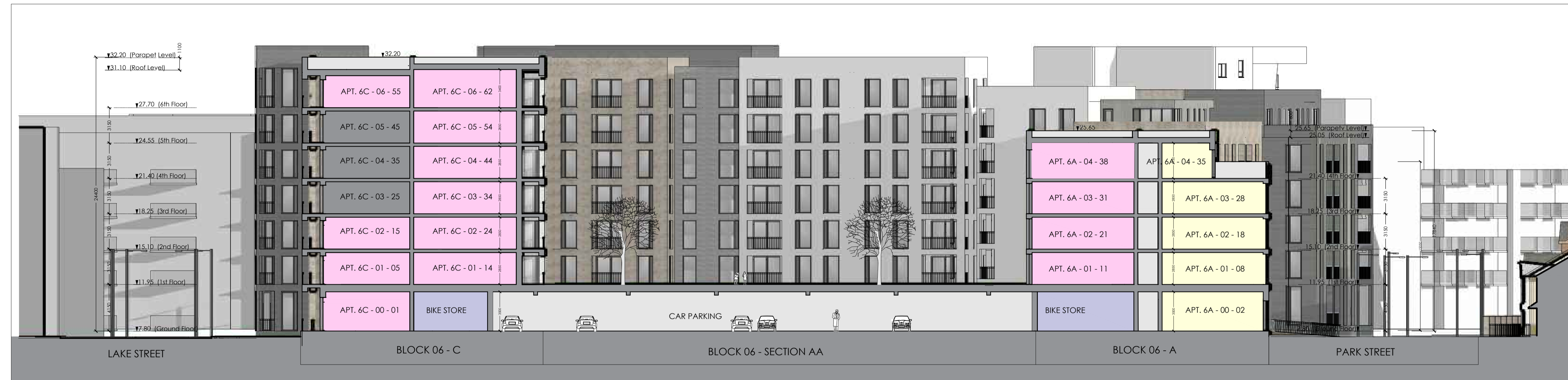
SECTION AA Scale 1:200