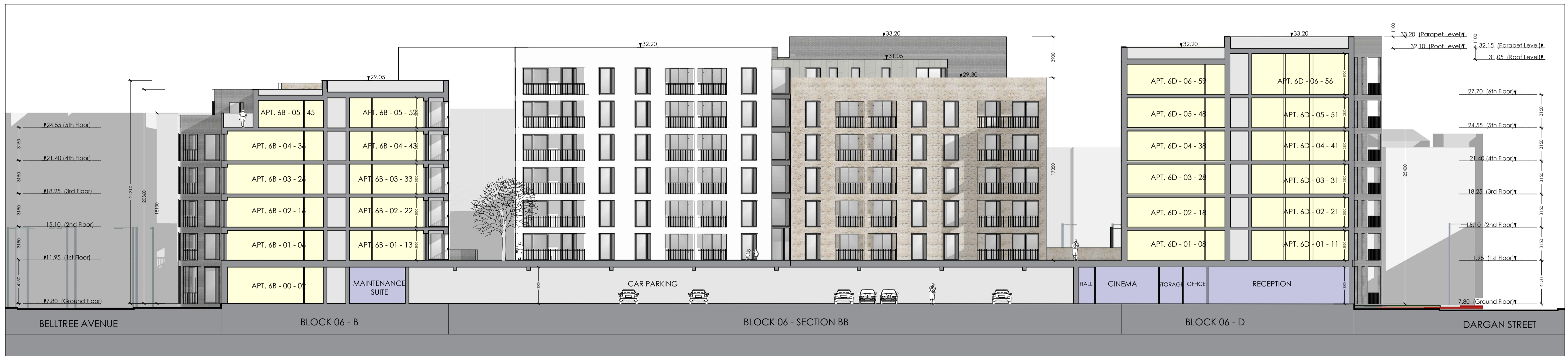
SECTION BB Scale 1:200